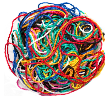
A Yarn Ball

We often think of knots as planar diagrams. 3-dimensionally, they are embedded in “pancakes”.