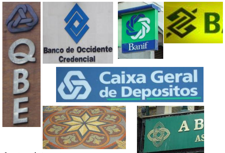
Banks like knots.