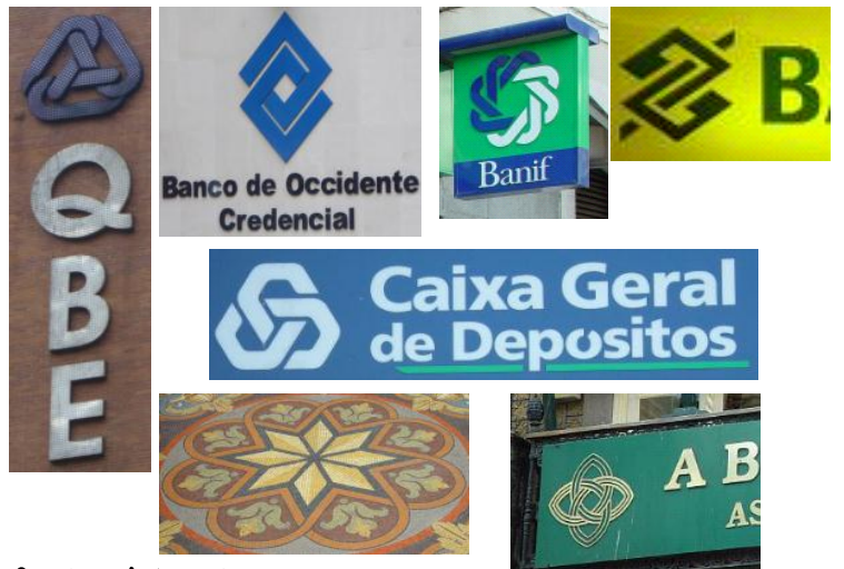
Banks like knots.