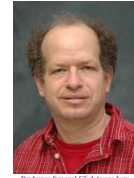
Do better images. Click to see how

Profile (CV, research and teaching statements, some opinions).