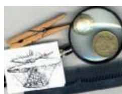
Odds, Ends, Unfinished