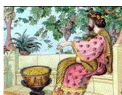
Bible Codes (I'm out! 1 / 2 )