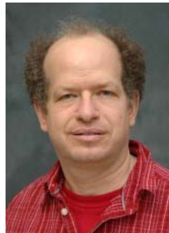
I'm hyper-famous! Click to see how

Profile (CV, research and teaching statements, some opinions).